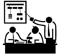
Committee In session