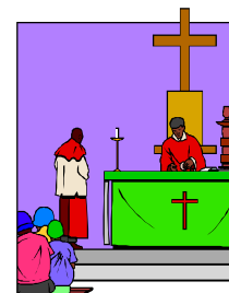
Pentecost service held at Plymouth.